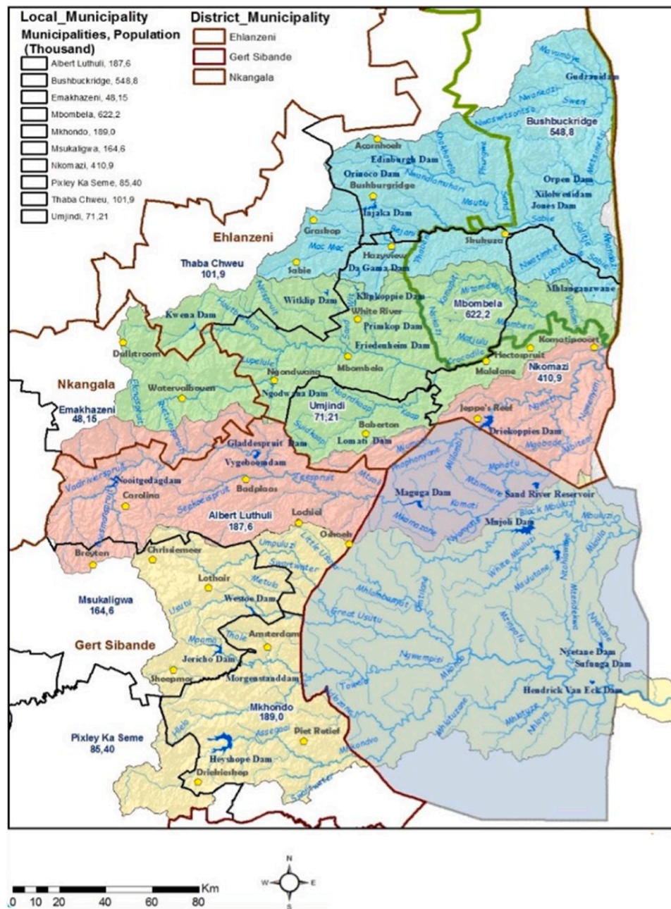
Fig. 1. The Inkomati-Usuthu Water Management Area indicating the four main catchments Sabie-Sand (blue), Crocodile (green), Komati (red) and Usuthu (yellow) (IUCMA, 2021).