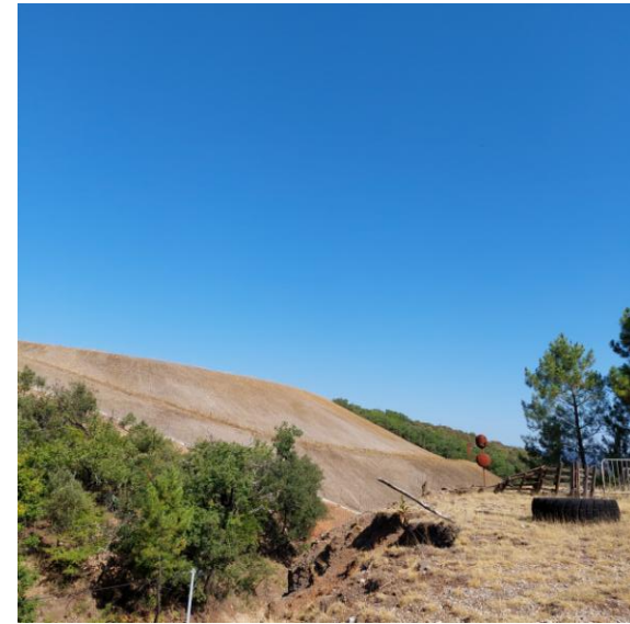
Umicore dam (2022)

Those who do not question their effectiveness