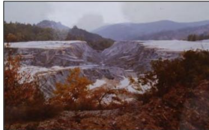
Crevasse caused by the 1976 Cévennes storms (DREAL archive 5.4.10) Source: Saint-Sébastien d'Aigrefeuille town hall website

"When you're standing at the sterile exit and you see the fluorinated water, orange, etc., you feel like you're on Mars . It's like being on Mars ."