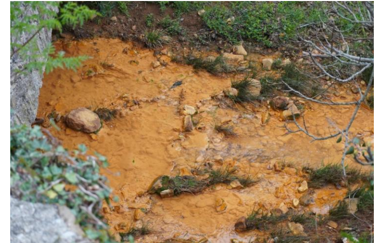
Detail of Reigous (Saint-Sébastien-d'Aigrefeuille)

"It was a lunar landscape with hollows and things. It was quite astonishing. People wanted to see it because it was a bit of an amazing sight. It looked like the moon ."