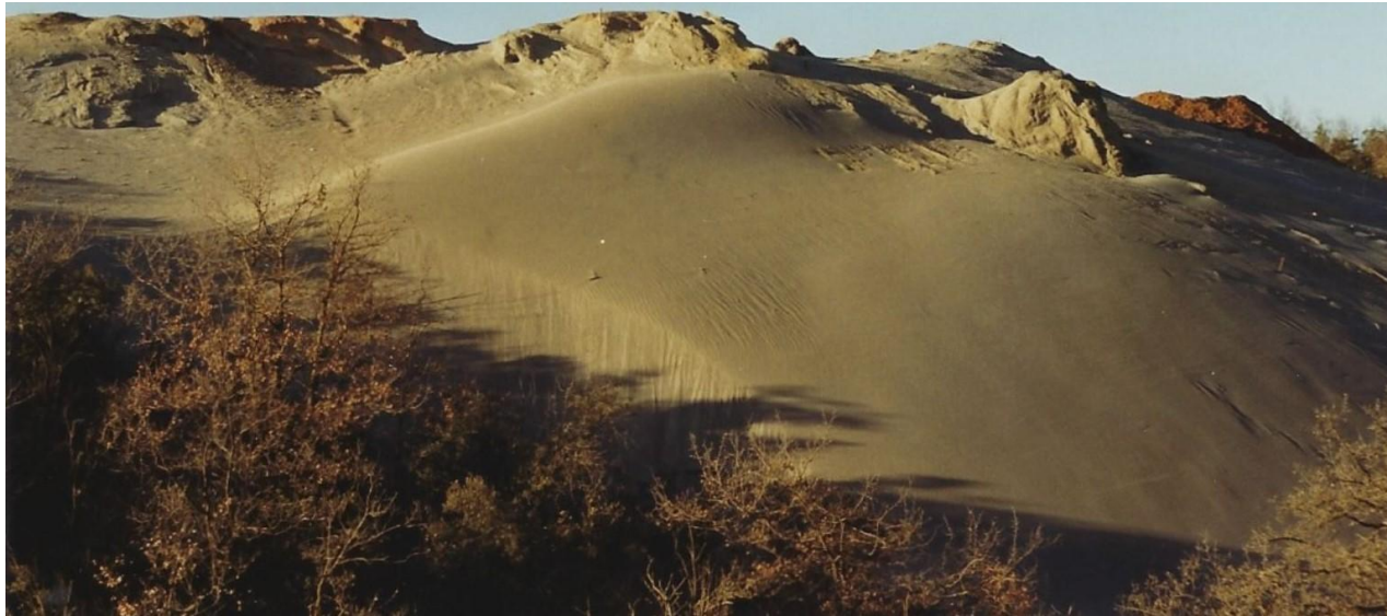
Résidus miniers de la mine de Pallières (1982)