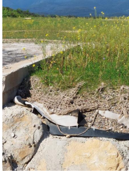
Detail of the Umicore dike