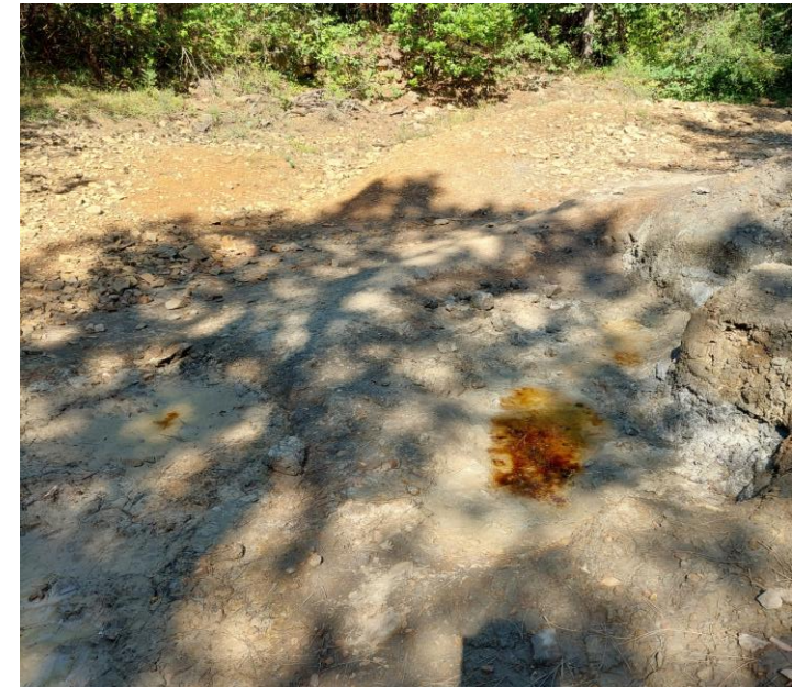
Cercle de l'Issart, Saint-Félix-de-Pallières

"My goats died rather prematurely. But I can't make the connection, I have no proof. Anyway... That's it. Nor do I want to link everything that can happen to this pollution. Because... Maybe not. That's all. So I think we need to remain a little reasonable."