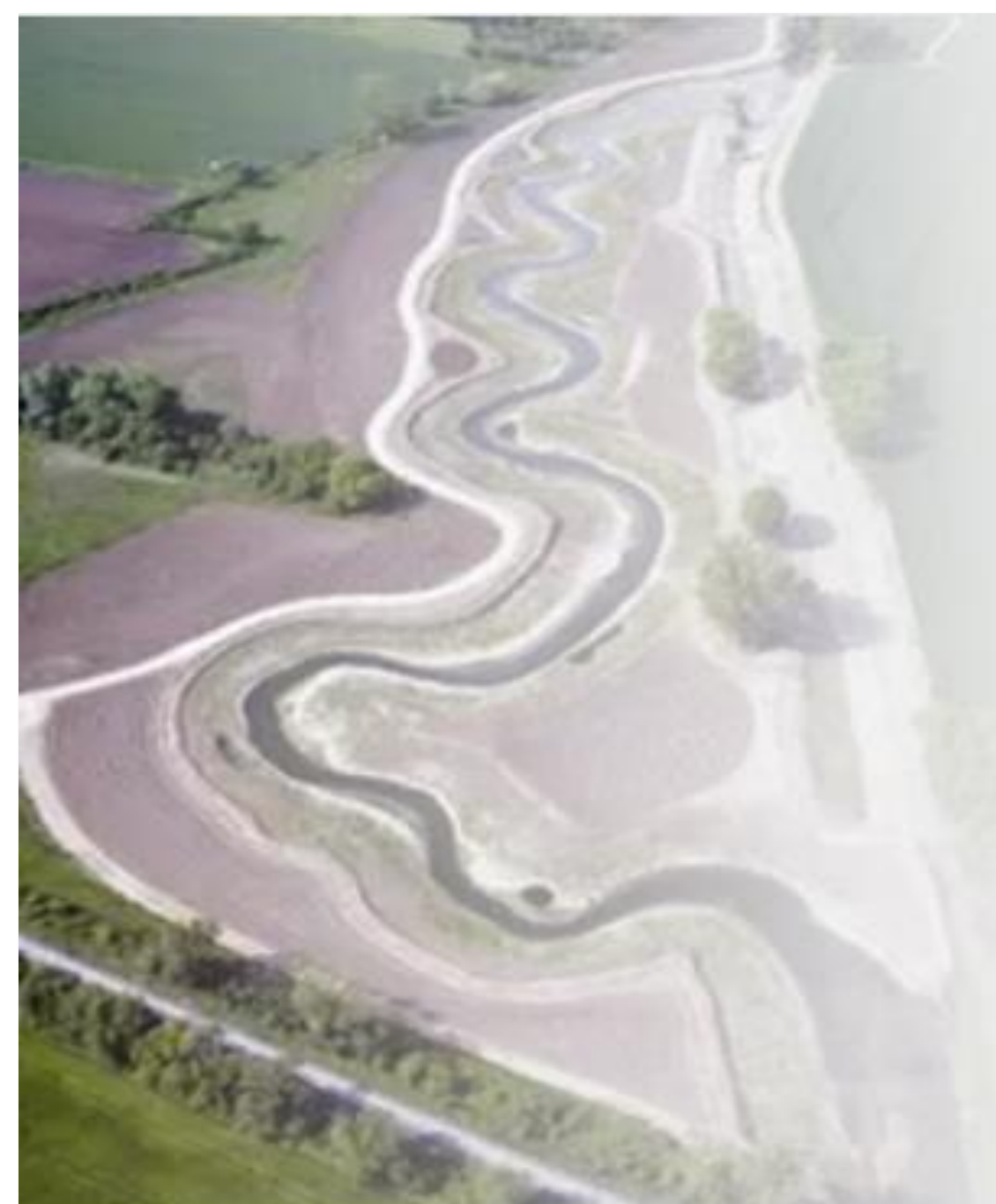
Recreation of meanders in the village of Milhaud, Gard Department.

Located in the south of France, in the department of Gard, between Costières and Garrigues, the Vistre is a Mediterranean river that rises north of the city of Nîmes in the town of Bezouce before joining the sea via the Rhone to Sète navigation canal.