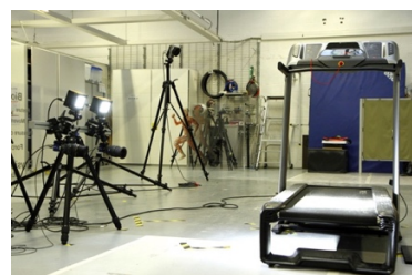
Figure 2: Presentation of the acquisition set-up