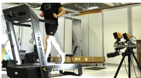
Figure 1: Data acquisition of a running subject

A total of 9 non-debutant runners with a specified shoe size EU43 participated to this study. 3D Foot scan was performed for each of them using Elinvision 3D Foot Scanner. Participants were asked to consecutively walk and run on a treadmill at 4km/h and 10km/h respectively (Figure 1), and perform countermovement jump. Five running shoes of different types and variable durability were tested. Shoes were new before the beginning of experiments and all participants used the same pairs. Left shoe of each pair had been priorly prepared with speckled black and white acrylic paint on lateral side.