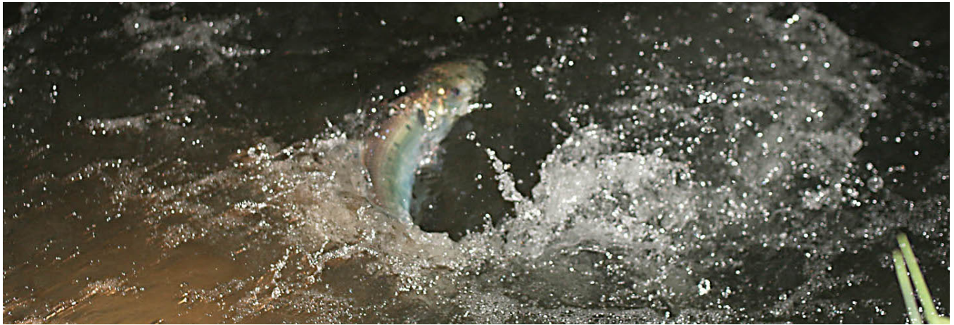
Figure 1: On spring nights, migratory fish produce splashes in rivers during spawning.

Thomas Guerin Elie Lambeaux Alexis Rotureau firstname.lastname@mines-ales.org