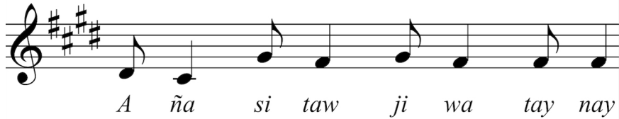
Figure 1. Example of odd stanza, line 1 (high melody).