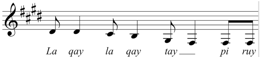
Figure 2. Example of Even Stanza, Line 3 (Low Melody).

The song ends with three consecutive lines sung in low pitch melodies, including the outlier line 19 and the two last lines. As the final low pitch of the second melody gives an impression of answer or conclusion, this final part could be analyzed as a musical a “bis” or a coda that concludes the song.