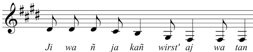
Figure 3. Stanza 11 Jiwañ jakañ wirst' ajwatan ‘We Sing Life and Death.’.

However, the rhythm slightly differs in the lines in stanza [11+12] because 9 notes are sung. These two lines confirm the global feeling of a ternary type meter. This is illustrated in Figure (3).