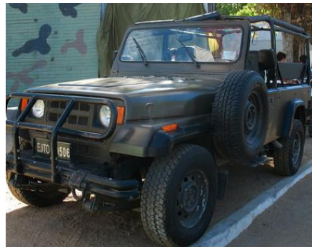
Figure 1. AIL Storm M240 model

The vehicle under study is mostly used in the desert climate in the north of Chile. This area presents daily thermal oscillations up to 35°C, low rainfall, and some of the highest solar DNI (direct normal irradiance) rates and clear sky indexes in the world.