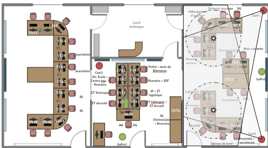
Fig. 1. Experimental installation with video cameras (red circles with field of view) and audio-recorders (black stars with approximate range). (Color figure online)

Observing the moment of lucidity relies on audio and video recording made -with the consent of the players- with tripod mounted stationary cameras (Fig. 1) which capture most of the players' activities from different angles without pre-selecting areas of interest [23].