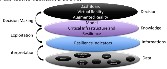
Fig 1. Proposal.

The state-of-the-art elements related to the resilience assessment reported in this paper show that no detailed study or demonstrator considered all the ambitions set by this paper. The following section describes our proposal to remove all the issues identified above.